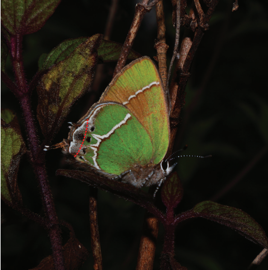
Figure 1. Callophrys xami in the Pedregal de San Ángel (Mexico City). In the experiment, the false head was ablated by cutting the segment to the left of the discontinuous red line with micro scissors.

design instead of exposing the female to the two males simultaneously because males defend mating territories and, thus, females never find more than one male when looking for a mate (Cordero and Soberón 1990). The cylindrical mating cages were made of mesh cloth and metal wire (25 cm diameter, 60 cm height). Each pair of mating cages were hung on a metal frame in a garden of the Instituto de Ecología (UNAM) in Mexico City, which is situated next to the Pedregal de San Ángel, the natural environment where C. xami inhabits. Replicates were placed between 11:00 and 14:00 h, and we finished a replicated earlier if the pair mated before the end of this period. Males and females in each replicate were matched, as much as possible, within each sex, for age and wing length. Males and females were never exposed to potential mates more than once, independently of whether they mated or not. When a couple mated, we measured copula duration and the female was transferred to a 1 liter white plastic container with a piece of leaf of the larval foodplant for oviposition. We put the female in the container under a 75W light bulb for two hours over two consecutive days. Under these conditions, females laid most of their eggs in the first two days of egg-laying (C. Cordero, personal observation).